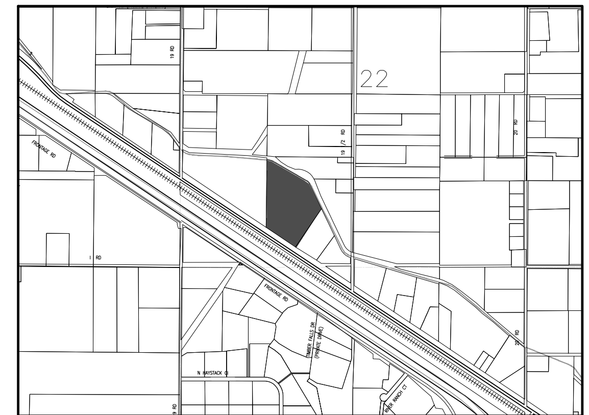
VICINITY MAP 1:1500