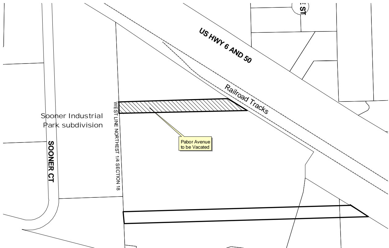
EXHIBIT "A" Ordinance #2011-03 Pabor Avenue Right-of-Way Vacation