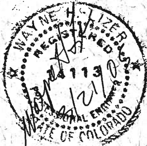
EXHIBIT 1.0 of 6.0