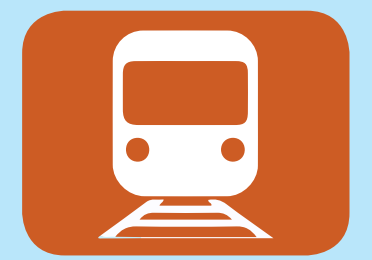
Nearest train station: Grand Junction (direct rail access available for business in Fruita)