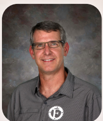
MAYOR JOEL KINCAID 250-9557

FRUITA CITY COUNCIL: If calling City Hall at 858-3663 does not answer your questions, please feel free to contact any of your City Council Members.