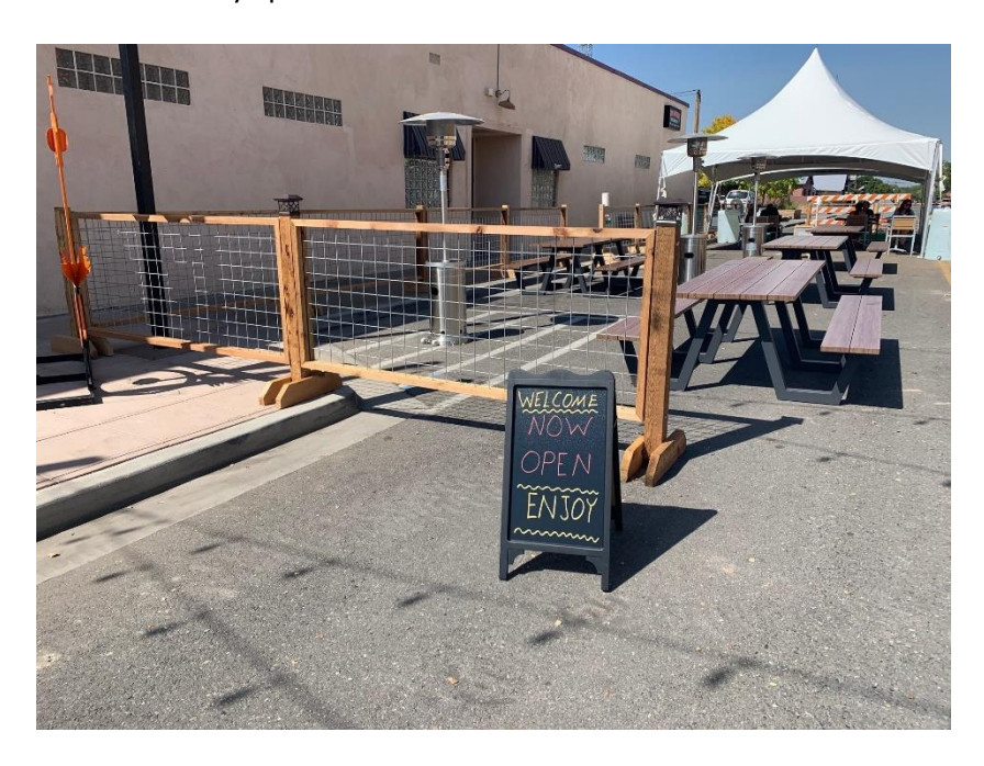
Honor the Past – Envision the Future \begin{cases} FRUITA \end{cases}

Only one COVID-19 update this week, and that is that both the N. Mulberry and the N. Peach Street outdoor dining and seating areas are open! Last week, we had a soft opening of the N. Peach Street area and that has gone very well. While we are still awaiting signage and other materials, N. Mulberry opened this afternoon. These spaces are free and open to the public, and we encourage guests to grab some take out from any of our local businesses and use these spaces. More information on this project (including FAQs) and others can be found at this <u>link</u>. Here a few photos from the N. Mulberry Space: