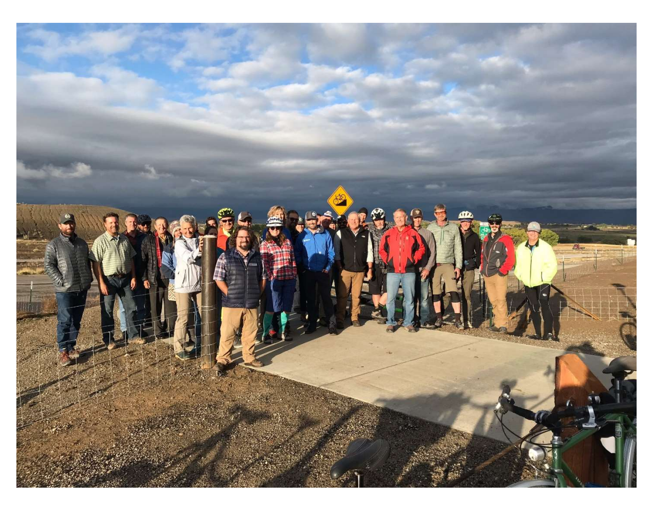
T.H.E Trails Summit —Australians, Jamaicans, Canadians and even Minnesotans, and friends from Wisconsin, Utah, California, Arizona, New Mexico, Nevada and many communities in Colorado were in Fruita to learn and share stories about Trails and the economics of outdoor recreation. If you didn't know already, Fruita is kind of a big deal when it comes to Trails and people want to know our story. But we received just as much knowledge from the Summit attendees as was dispersed. We like to thank Over the Edge Sports for hosting this fabulous international event and look forward to next year.