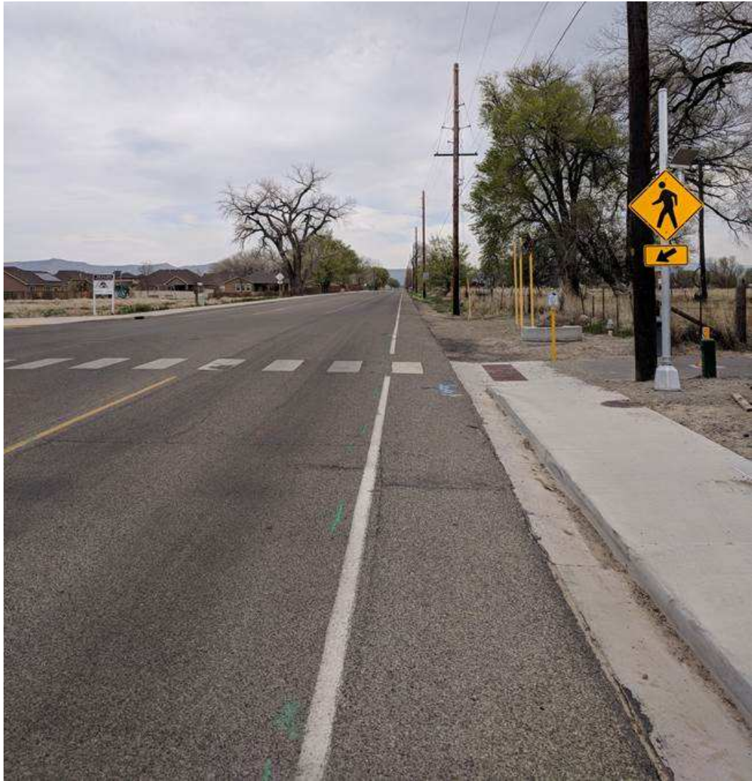
May is Bike Month