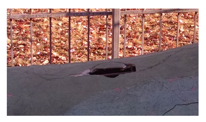
Grrrreta's Estimated Repair Cost: $8,500