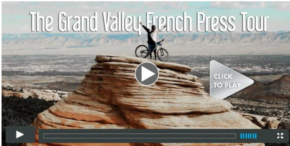
The Grand Valley French Press Tour