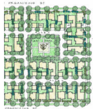
Example of townhomes oriented to open space