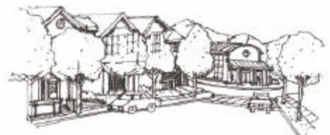
Proximity to schools

Two (2) points possible for dedicating land for a school or contributing to school facility improvements that directly benefit the school